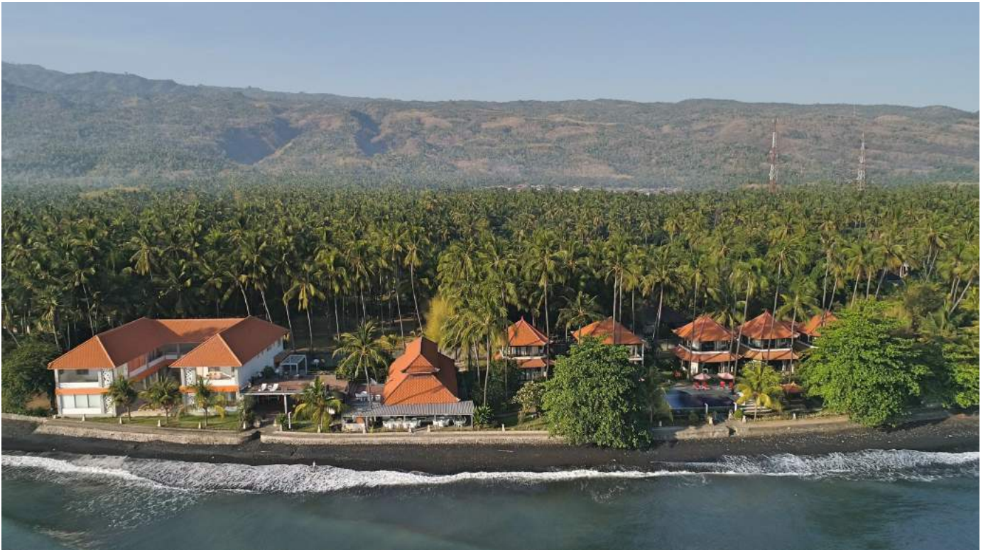
Bondalem Beach Club aerial view